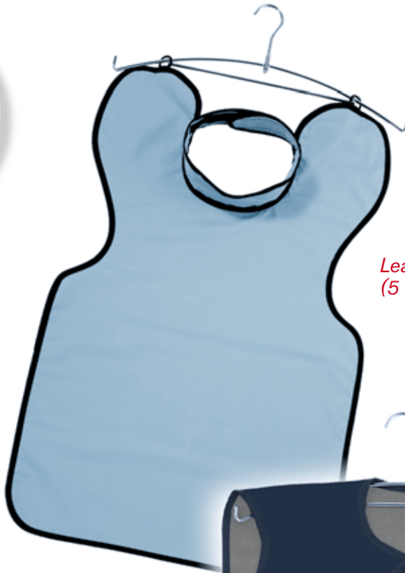
Lead-Free Apron with collar (5 mm), Light Blue.

Both versions with Scotch-Guard™, durable non-slip corduroy backing.