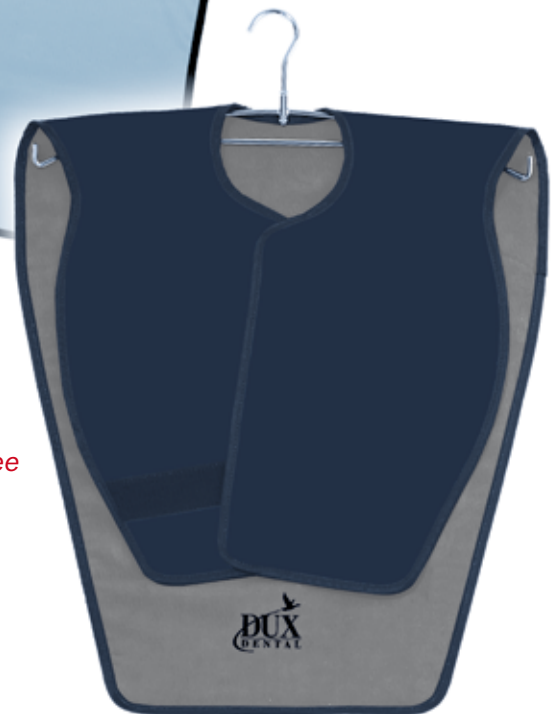
Panoramic Poncho Lead-Free (5 mm), Charcoal.

As light and as soft as a blanket , the Xenolite™ Lead-free X-Ray Aprons protect your patients from secondary radiation during intra-oral and panoramic radiography, without the inconvenience of lead. Covered with a new hi-tech alloy that ensures the same protection as lead, they weigh 30% less than standard lead aprons.